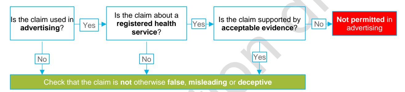
Figure 1: When claims are not supported by acceptable evidence and so are not permitted in advertising under the National Law

AHPRA and the National Boards have published further guidance about acceptable evidence at <a href="https://www.ahpra.gov.au/Publications/Advertising-resources/Further-information.aspx">www.ahpra.gov.au/Publications/Advertising-resources/Further-information.aspx</a>.